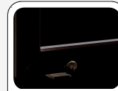
Lock fitted as standard