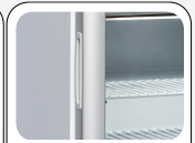
Painted aluminium door frame with integrated handle